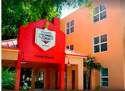
Ronald McDonald House Charities