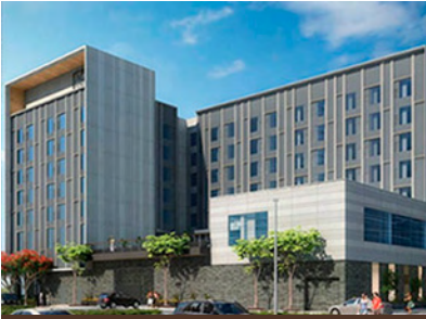
AC Hotel by Marriott (Dadeland Mall)