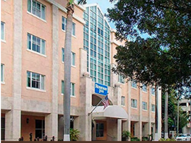
Rodeway Inn South Miami